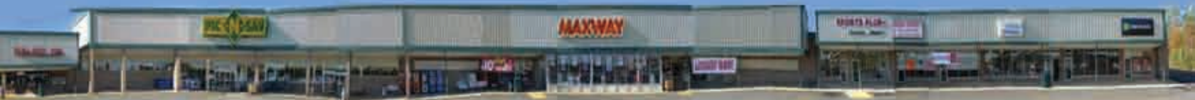
EXISTING OVERALL ELEVATION